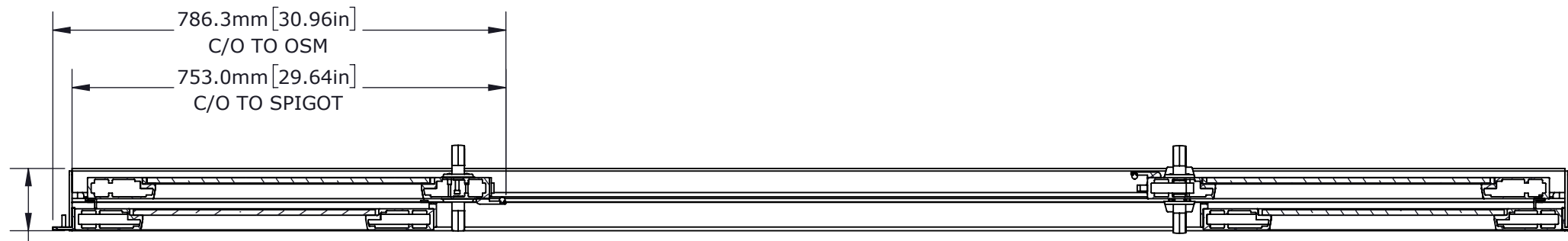
SECTION A-A SCALE 1 : 10