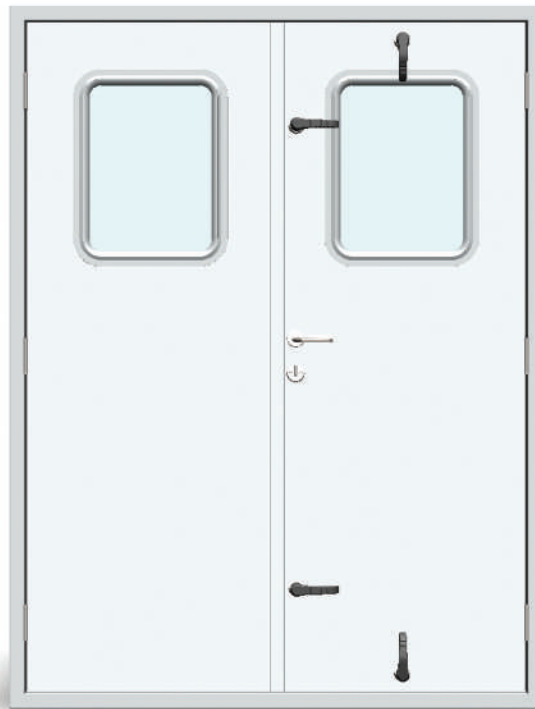
1611 Bonded Ind. Dog AL Weathertight French DBL Door

Bonded construction Individual dog french weathertight door. Multiple plate thickness constructions available. All dis-similar metal contact fully isolated. Adequate for a wide range of vessels types including Ferries, Workboats, Fishing vessels, large commercial ships etc. A great value and affordable product.